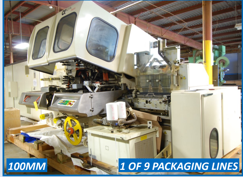
SASIB ALFA SOFT PACKAGING LINE

312 Fair Oak Street, Little Valley, New York