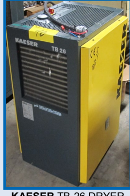
KAESER TB 26 DRYER