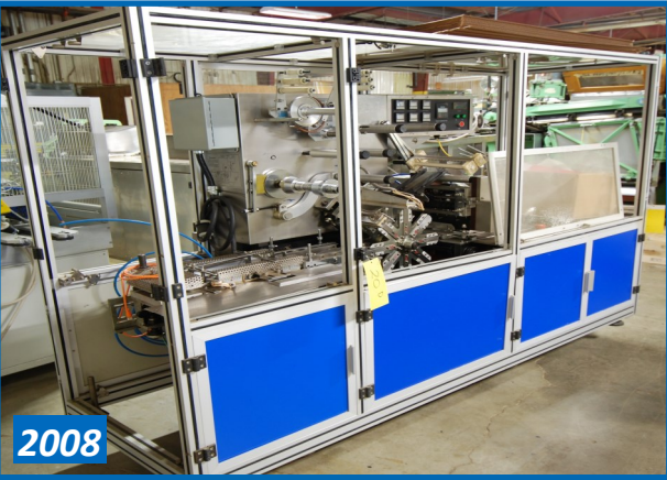
TDC MD-820, HFP-920 SHISHA PACKER LINE