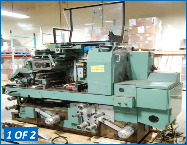
MOLINS HLP-5 HINGED LID CIGARETTE PACKAGING LINE