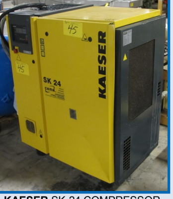
KAESER SK 24 COMPRESSOR