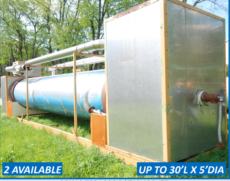
COMAS TOBACCO ROTARY DRYER

Online Auction Only: Bidding Ends Tuesday August 15, 11:00AM (ET)