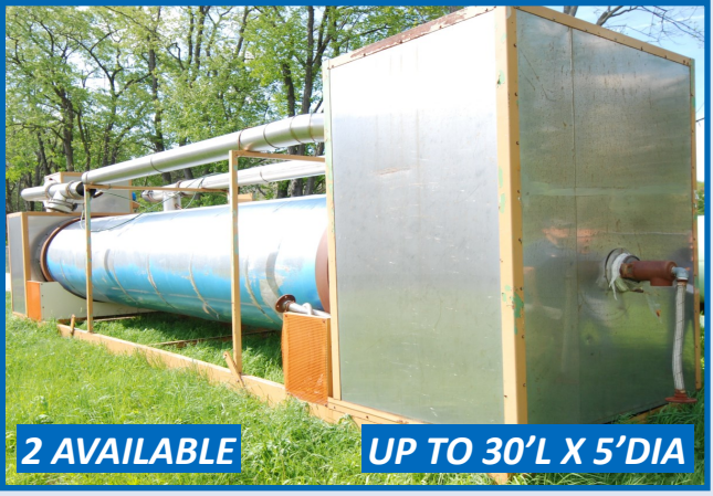
COMAS TOBACCO ROTARY DRYER